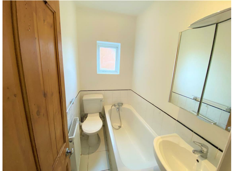
Bathroom 7'2" x 3'11" (2.2 x 1.2)