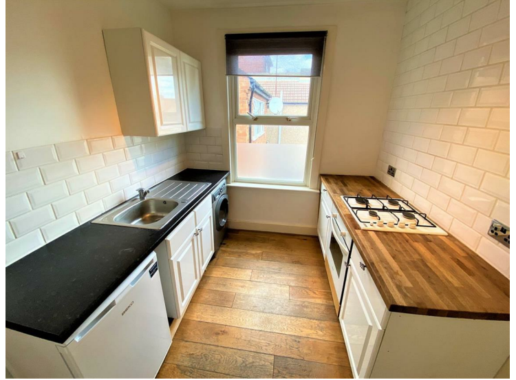
Kitchen 9'6" x 7'6" (2.9 x 2.3)