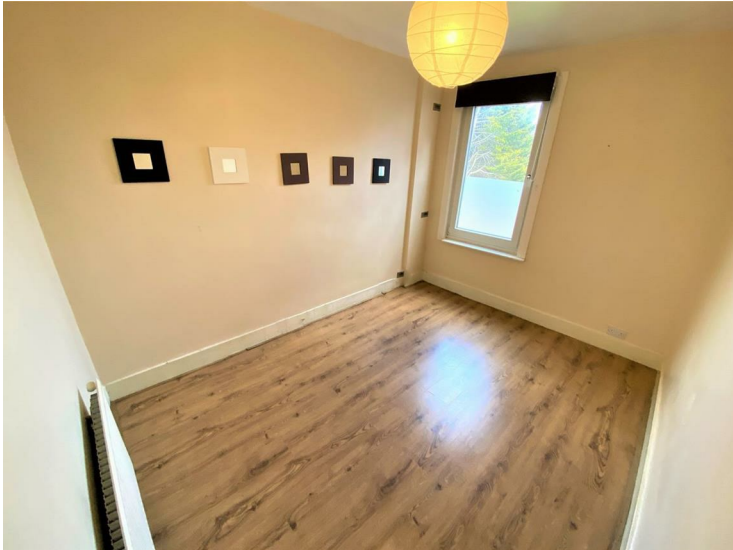
Double Bedroom 12'1" x 9'2" (3.7 x 2.8)