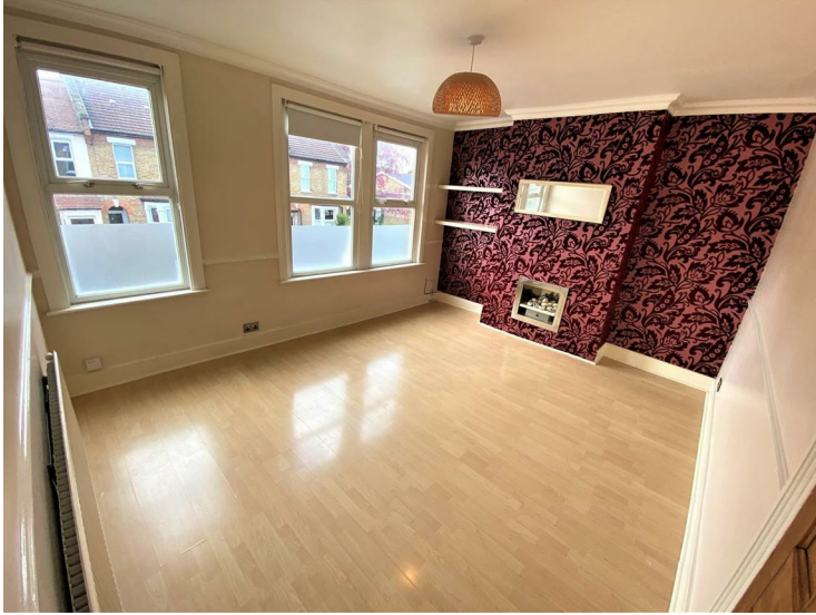
Reception 14'9" x 12'1" (4.5 x 3.7)