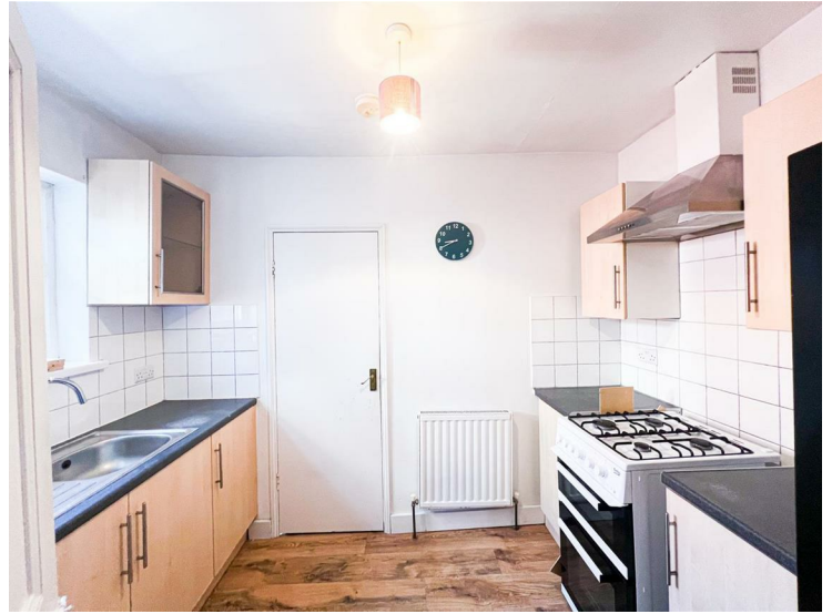
Kitchen 6'11" x 10'5" (2.12 x 3.19)