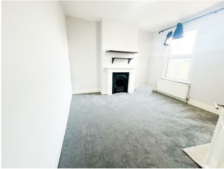
Reception Room 12'5" x 11'11" (3.8 x 3.65)