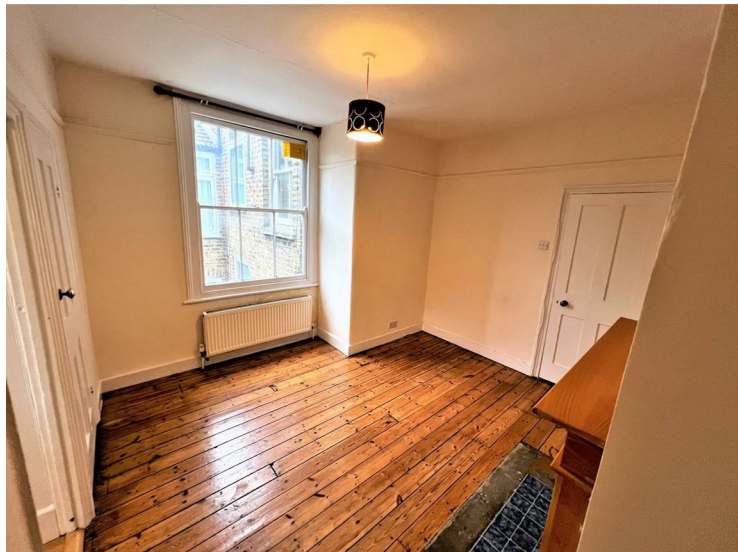
Reception 11'7" x 11'8" (3.55 x 3.58)