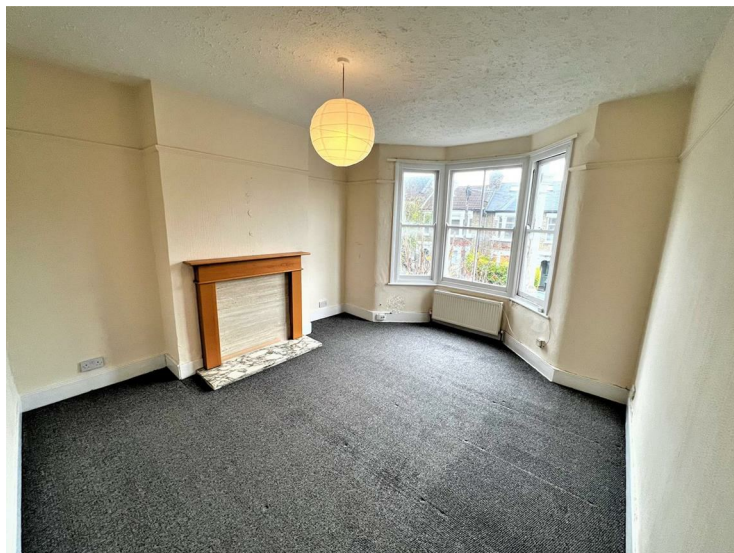
Bedroom 2 14'4" x 12'4" (4.39 x 3.77)