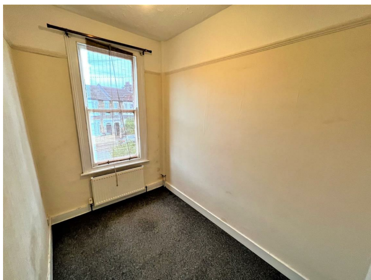
Bedroom 3 8'11" x 5'10" (2.72 x 1.78)