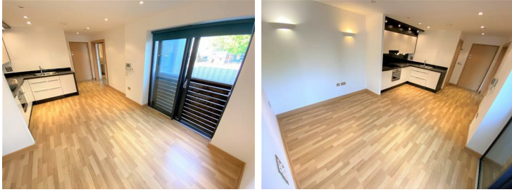
Kitchen & Living 24'2" x 11'5" (7.39m x 3.5)