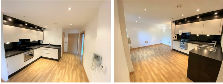
Kitchen & Living 24'3" x 11'5" (7.4 x 3.5)