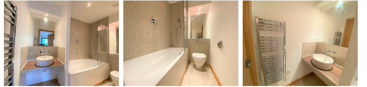
Bathroom 9'6" x 4'7" (2.9 x 1.4)