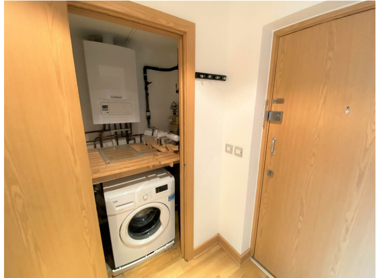
Washing Machine & Boiler