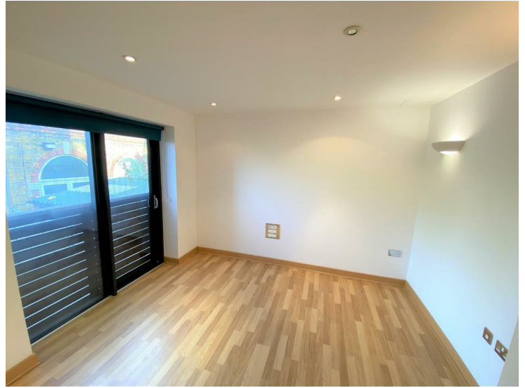
Living Area 11'5" x 8'2" (3.5 x 2.5)