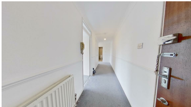
Entrance Hall 18'0" x 3'11" (5.5 x 1.2)