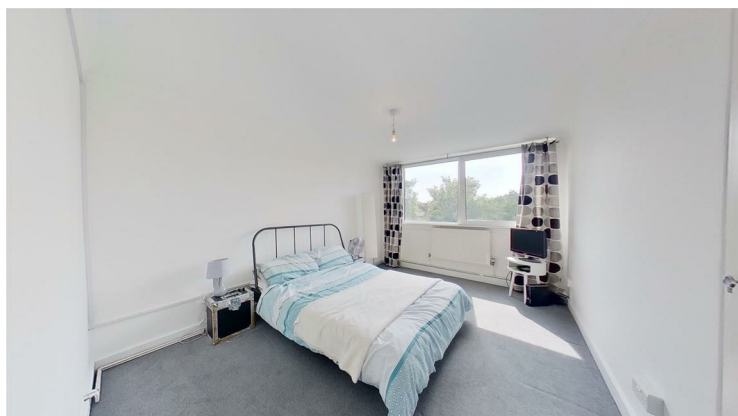
Bedroom 2 8'2" x 9'2" (2.5 x 2.8)