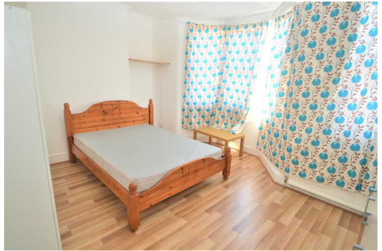
Bedroom 15'1" x 13'5" (4.6 x 4.1)