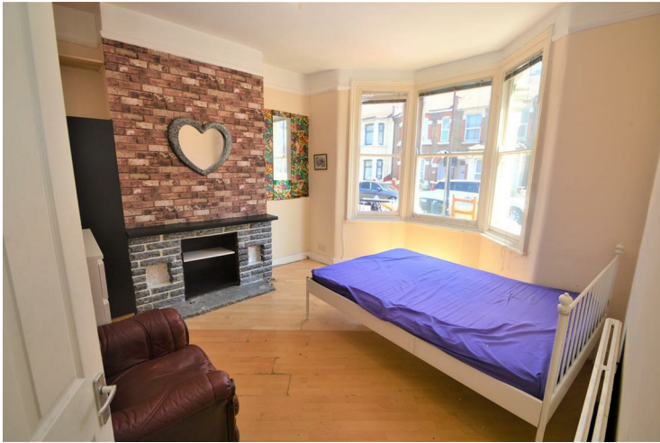
Bedroom 13'5" x 11'9" (4.1 x 3.6)