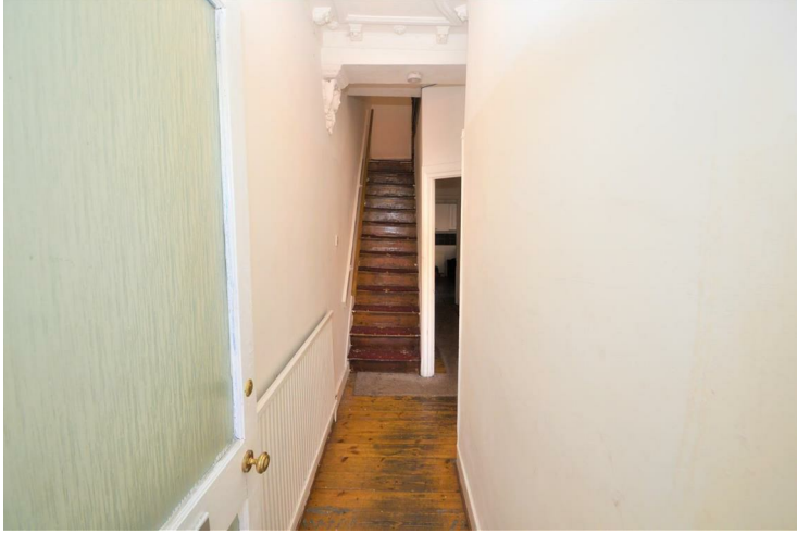
Entrance Hall 10'5" x 2'11" (3.2 x 0.9)