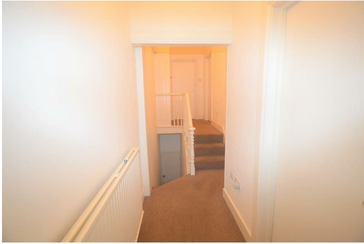
Hallway 3'7" x 14'1" (1.1 x 4.3)