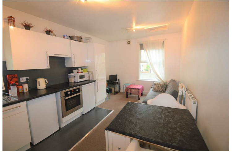
Kitchen/ Diner 15'8" x 9'6" (4.8 x 2.9)