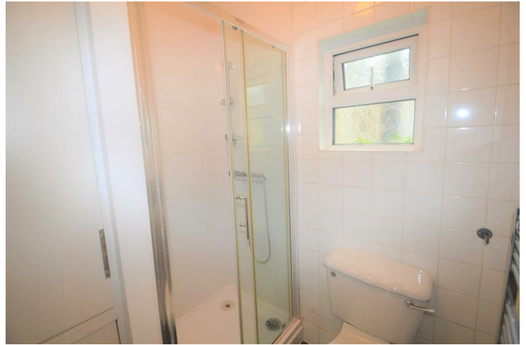
Shower Room 5'6" x 5'6" (1.7 x 1.7)