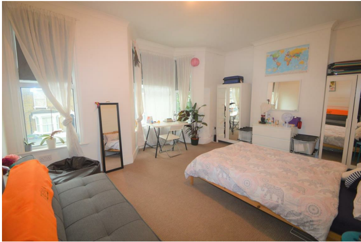
Reception 14'1" x 16'4" (4.3 x 5.00)