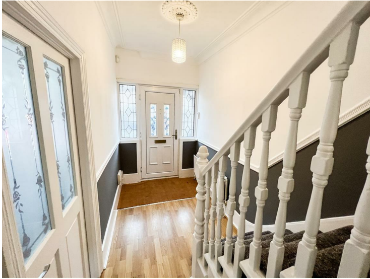
Hallway 15'6" x 5'8" (4.74 x 1.75)