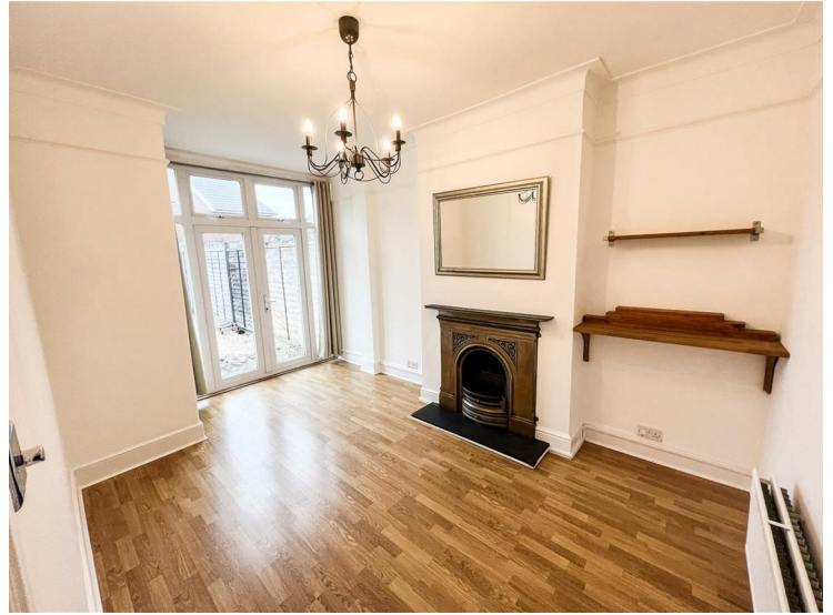
Dining Room 15'6" x 9'8" (4.73 x 2.97)