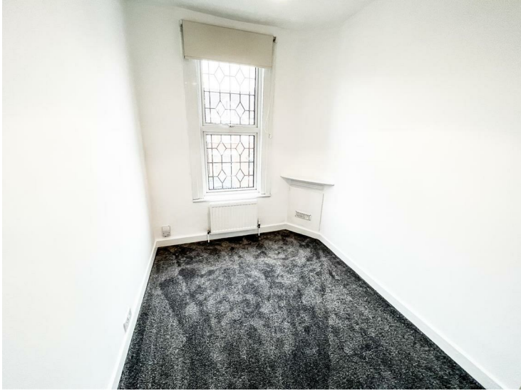
Bedroom 8'7" x 7'1" (2.64 x 2.16)