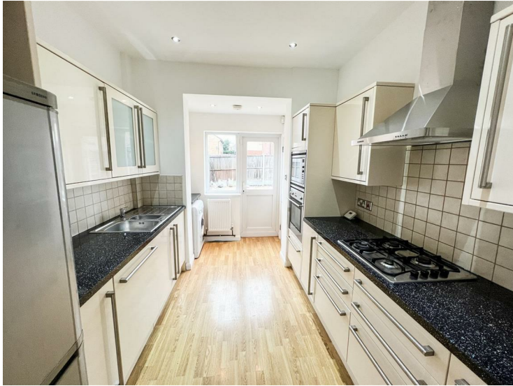
Kitchen 12'7" x 8'7" (3.85 x 2.64)