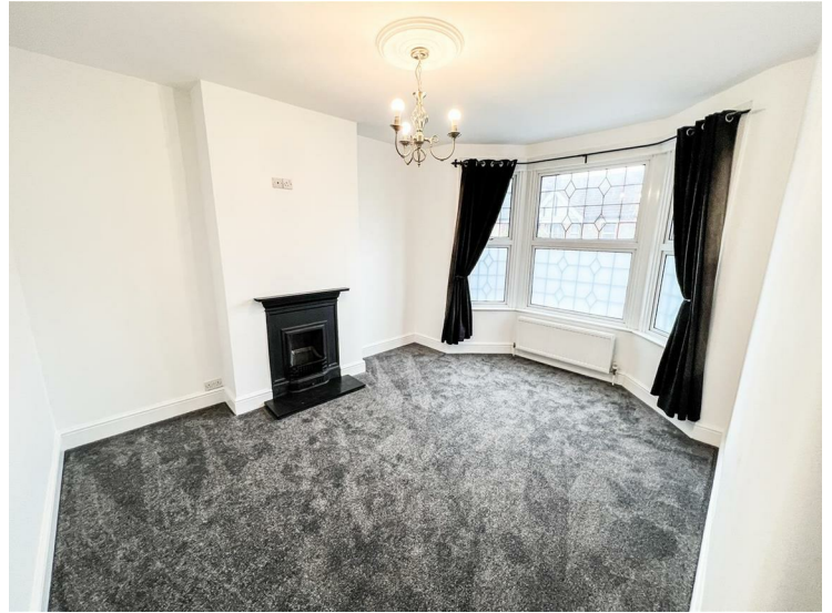
Double Bedroom 14'7" x 12'7" (4.47 x 3.86)