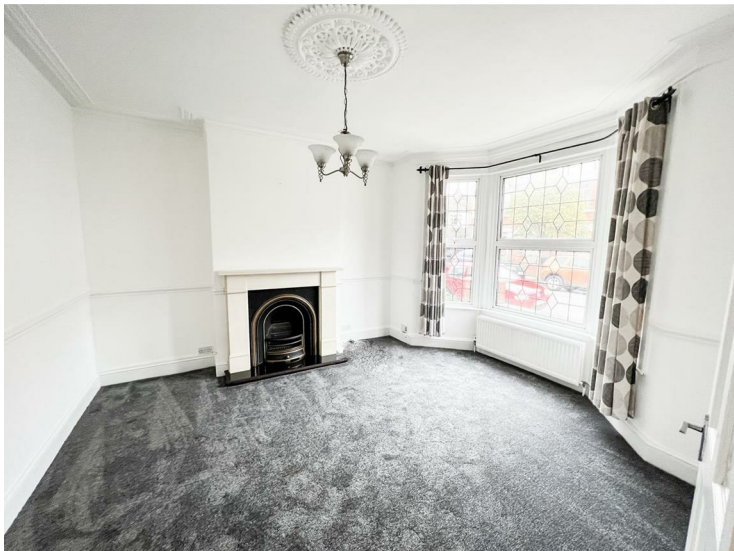
Living Room 14'5" x 13'3" (4.41 x 4.05)