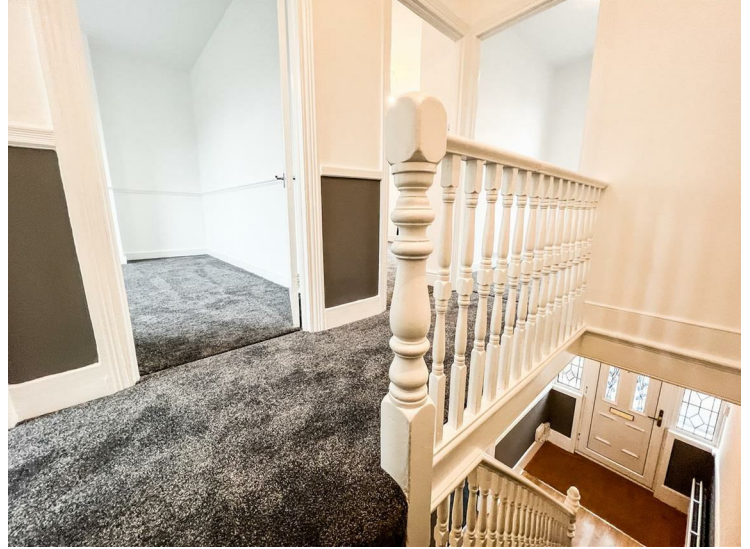
1st Floor Landing 8'2" x 5'10" (2.5 x 1.78)